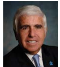
Mel Karmazin, CEO